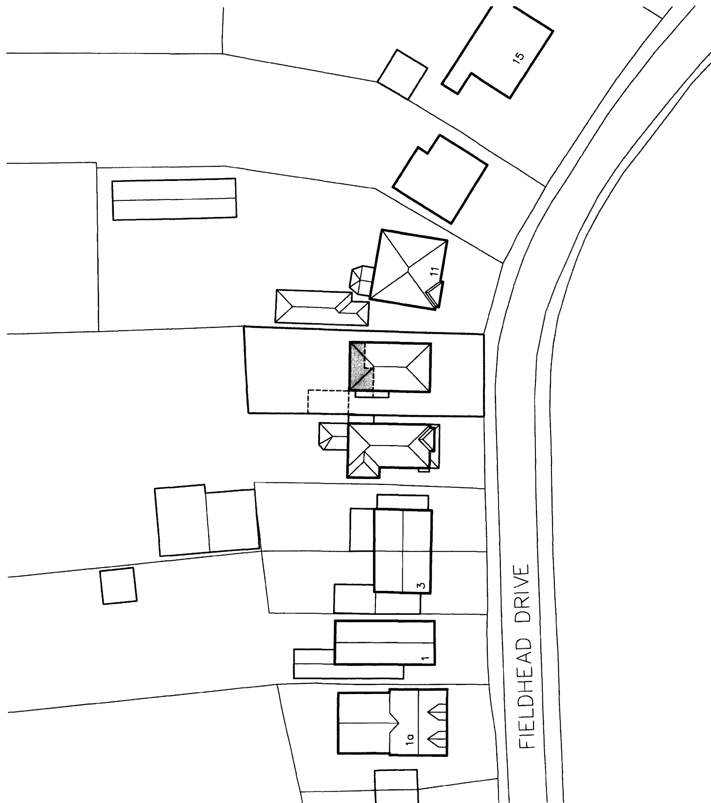
LOCATION PLAN 1:500